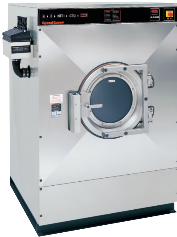
SC125 shown with optional external supply injection